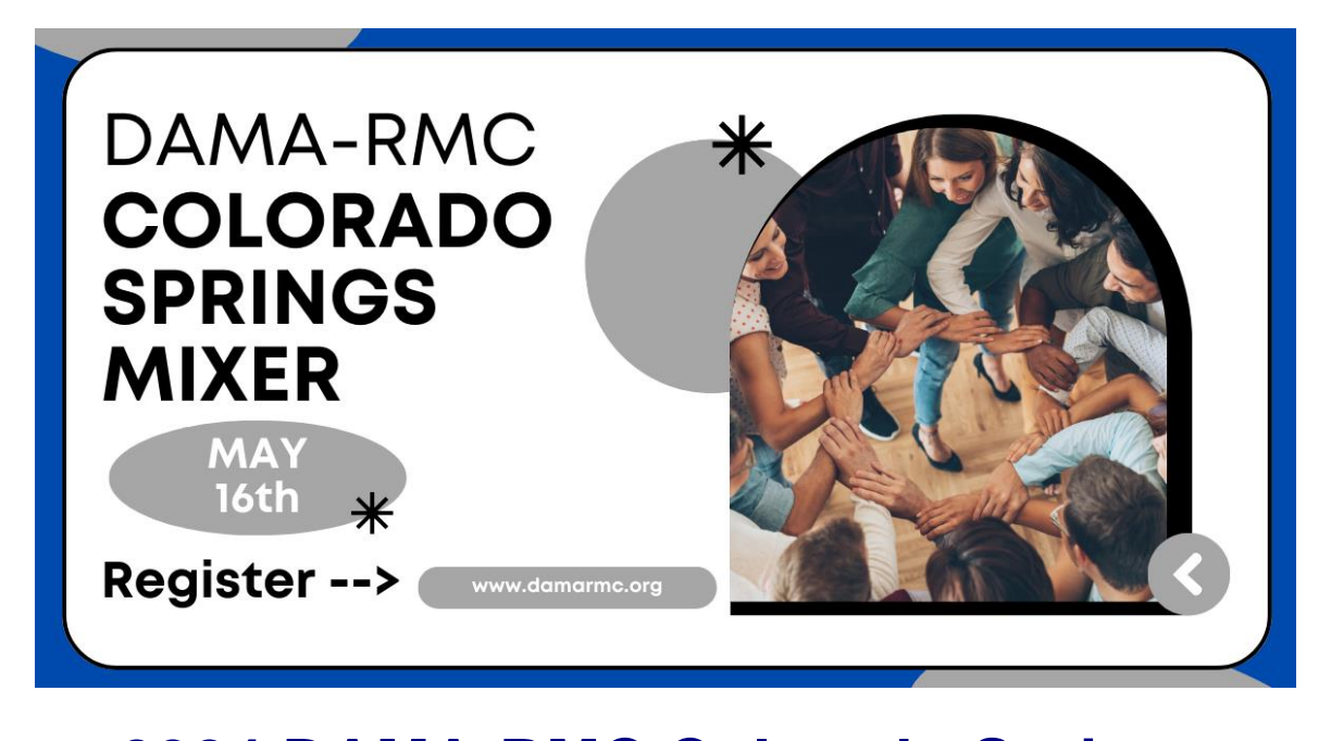
2024 DAMA-RMC Colorado Springs Mixer